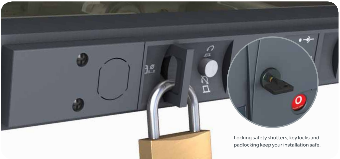
Locking safety shutters, key locks and padlocking keep your installation safe.